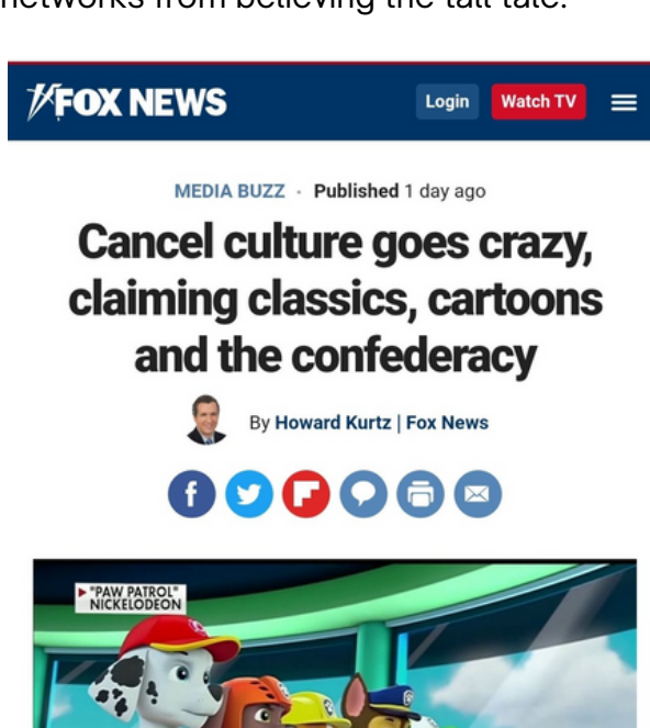
Charles Payne blasts ridiculous criticism of 'Paw Patrol' as pro-cop propaganda

On the surface, this may seem like a harmless prank. However, these social media hoaxes are created with the intention of distracting media platforms from real issues by discrediting the people that are fighting for justice. In the first example, a new hoax pops up every time there is a chance of advancing rights for the LGBTQ community. This is why the "gay people support pedophiles" hoax is a reoccurring problem. In the second example, the "outrage over Paw Patrol" hoax happened during the protests following the murder of George Floyd. The intention of the individuals creating these posts was to convince the public that the people pushing for police reform and demanding that police to be held accountable when they break the law... were just being ridiculous. How can we take anyone seriously when they are offended by cartoon puppies? That's the goal: to create a straw-man argument and distract from the reality of the situation.